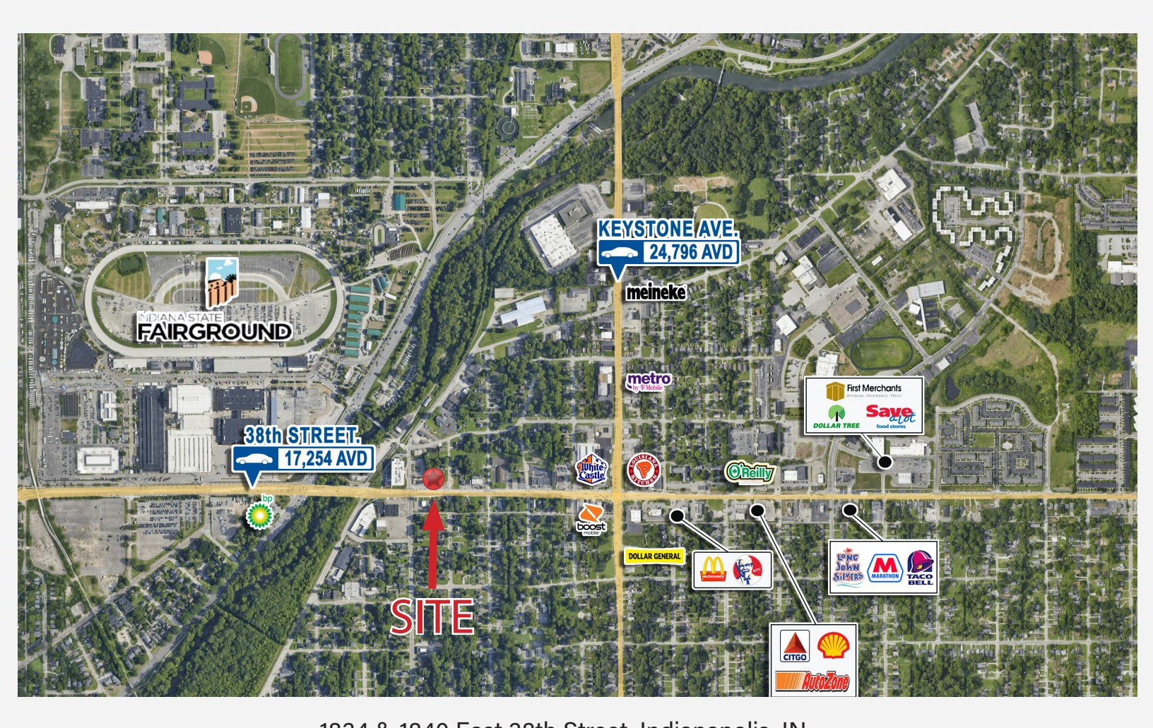
1834 & 1840 East 38th Street, Indianapolis, IN